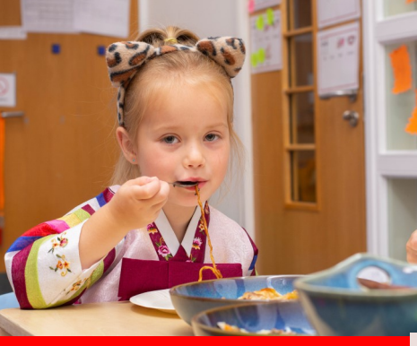
We have a fully equipped kitchen on site and our catering team provide high quality meals for the children each day. The catering team can meet any dietary needs.