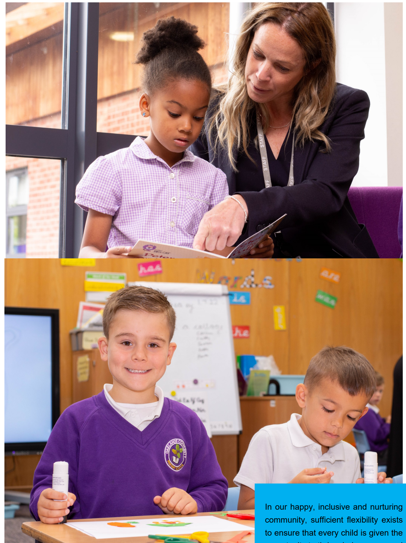
On the school site we have a fantastic Autism Base, privately run day nursery and wrap around care provision.